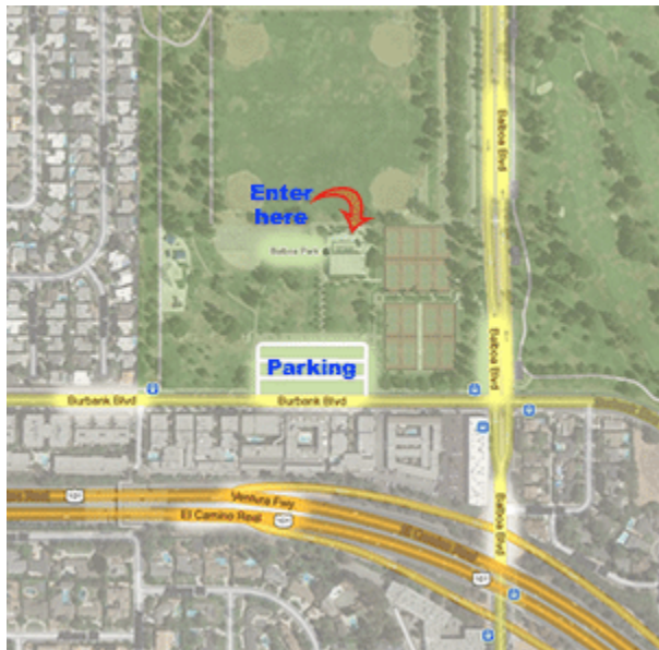
Balboa Recreation Center Location Map