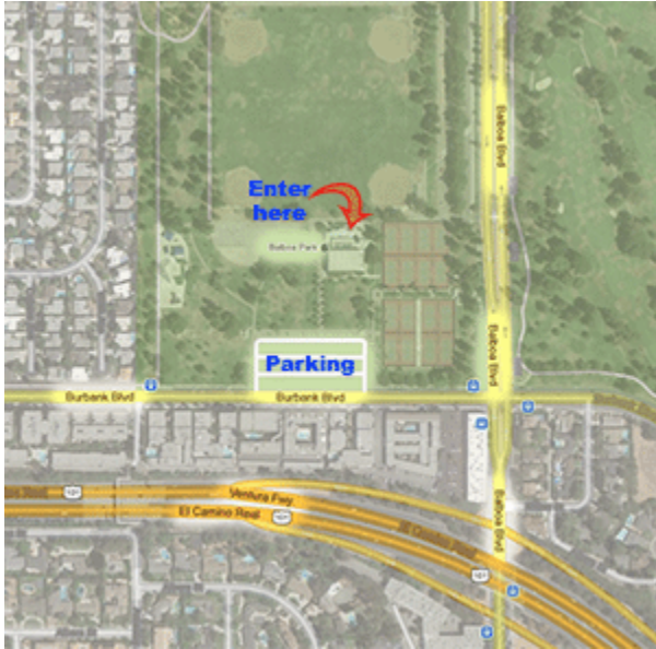
Balboa Recreation Center Location Map

The club was formed in 1988 for the purpose of enhancing skills, providing information and sharing the joys of working with wood. The membership reflects a cross section of woodworking interests and skill levels - both hobbyist and professionals. Annual dues are $35. Full-time student dues are $15.